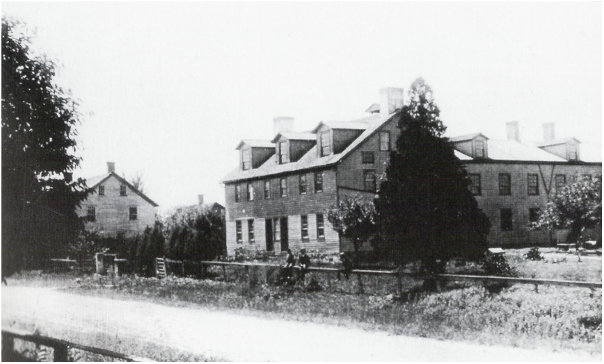
North Union Center Family dwelling house