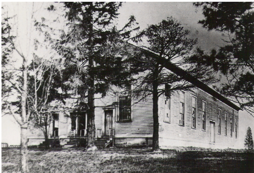
North Union meeting house