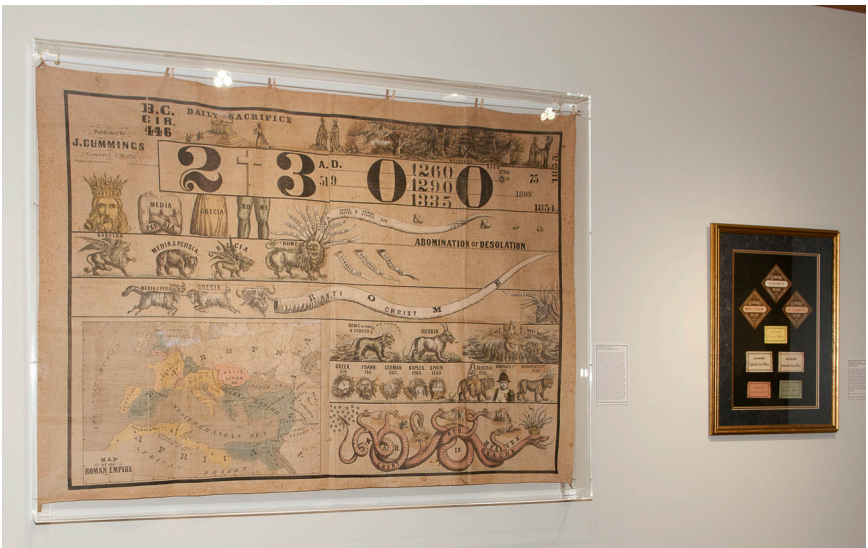
Adventist chart showing the end of the world in 1855, and a collection of Harmonist wine labels.