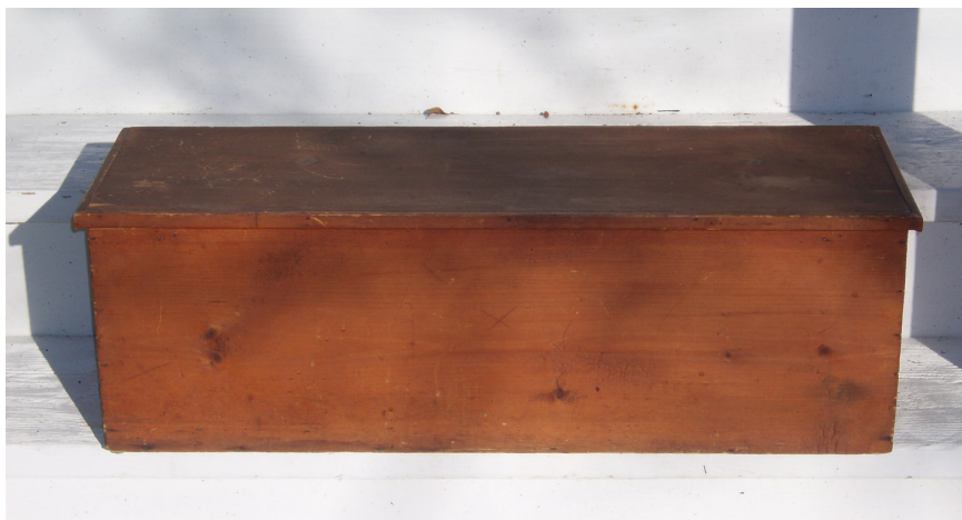
Fig. 1. Exterior of a Harvard pine box which was lined with label sheets.

In the nineteenth century, before regular bathing was common practice, these waters were marketed primarily as toilet waters or perfumes. Rose water was also combined with other distillates, such as witch hazel, to make a “tonic” or astringent for use on oily skin. In the twentieth century, by contrast, the waters were more often used as food flavorings. Although little information is found for the Shakers’ manufacture of peach water—the earliest reference found in journals from Harvard dates to October of