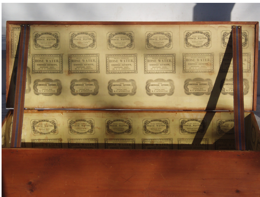
Fig. 2 (above) and 3 (below). Interior of the Harvard pine box lined with label sheets before their removal.