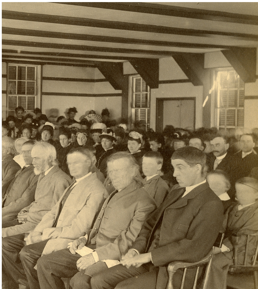
Detail of the photograph. See next page for full image.