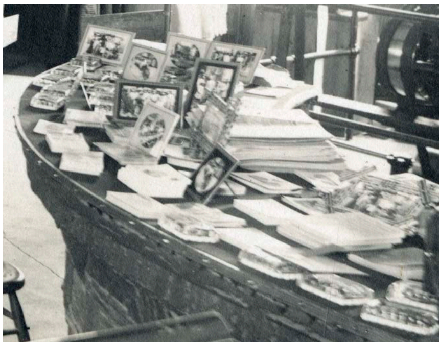
Fig. 3: Souvenirs for sale in the Print Shop , including glass paperweights manufactured with photographic images of the colony inside.