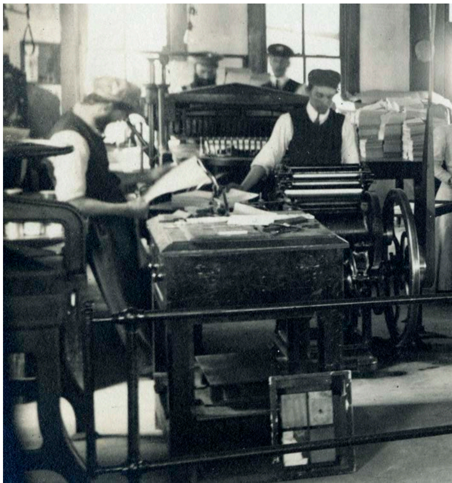
Fig. 7: Compositors and Pressmen at work in the Israelite Print Shop.