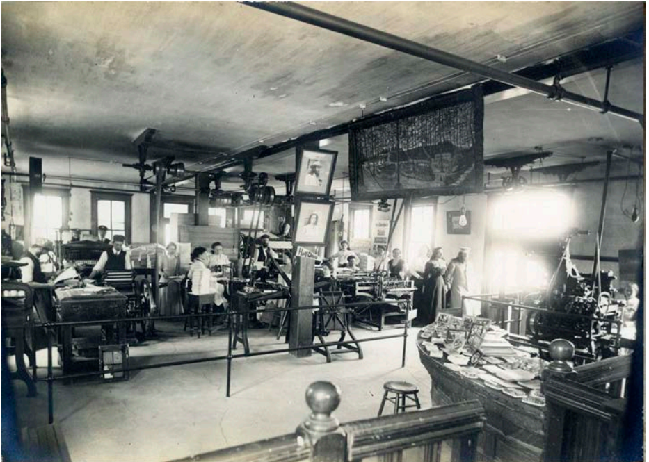
Fig. 1: The interior of the second Print Shop at the Israelite House of David, Benoton Harbor, Michigan, prior to its destruction by fire in 1908.