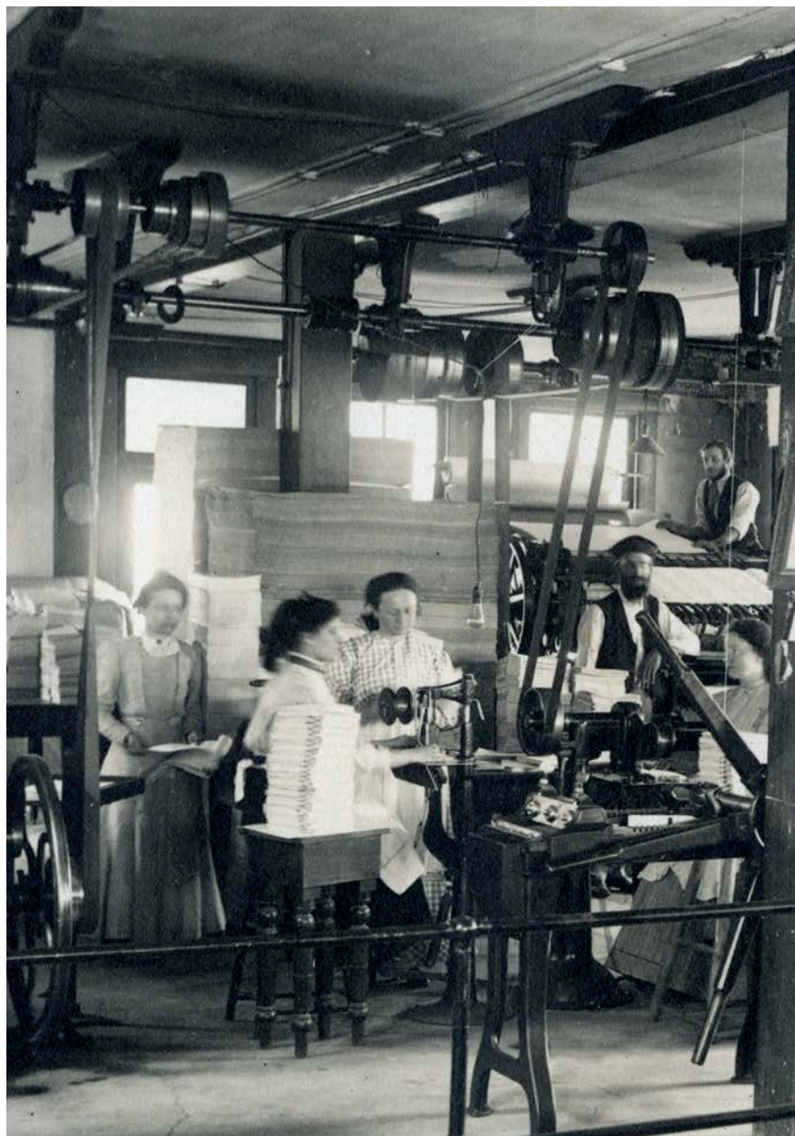
Fig. 8: Folders and Stitchers at work in the Israelite Print Shop.