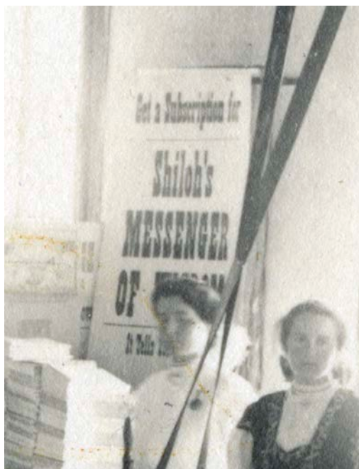
Fig. 4: A poster urging visitors to subscribe to the Israelite's monthly periodical Shiloh's Messenger of Wisdom .